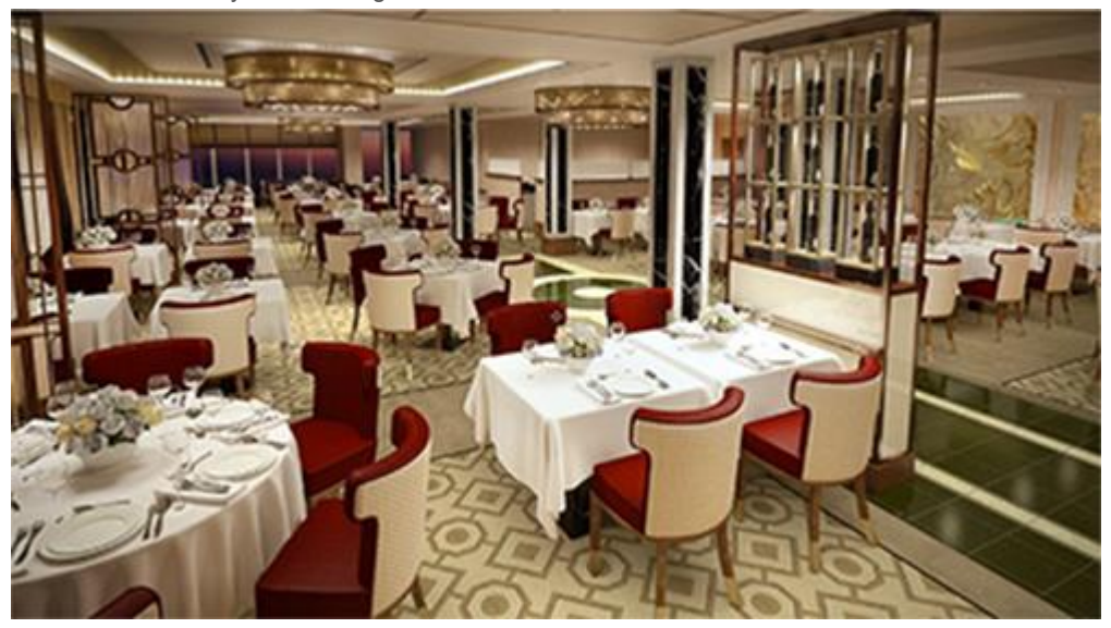
Rendering of Queens Grill restaurant

The Grills dining experience will be redesigned to elevate what is already the utmost in sophisticated dining at sea. The new Grills restaurants will each display a distinctive character through design, colour scheme and furnishings, and offer more intimate tables for two, increased space between tables for privacy, and additional loose tables for the ultimate in flexibility and ambiance. Spacious, beautifully redesigned dining rooms with rich, updated décor will be complemented by new culinary options and anchored by Cunard's signature White Star Service.