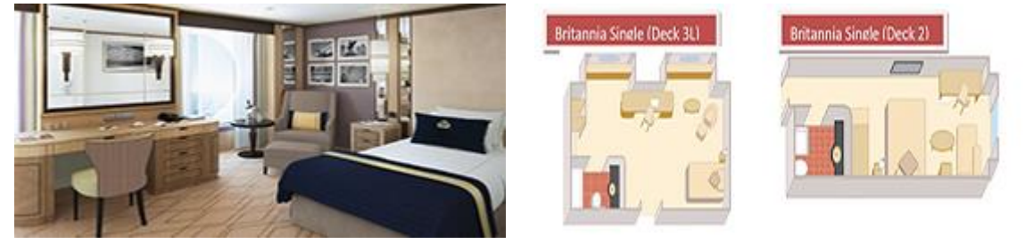
Rendering of Large Britannia Single stateroom

In consideration of the solo traveller, single staterooms will be added to our flagship during the refit, making this offering now available fleet-wide. Of the 15 Britannia Single staterooms that will be added, nine single cabins will be on Deck 2 and six larger single staterooms will be built on Deck 3L. New single cabins on port side Deck 2 will benefit from increased ceiling height and an illuminated coffered ceiling. New single cabins on port side Deck 3L will feature two unique circular windows with bench seat cushions and a central dressing console table.