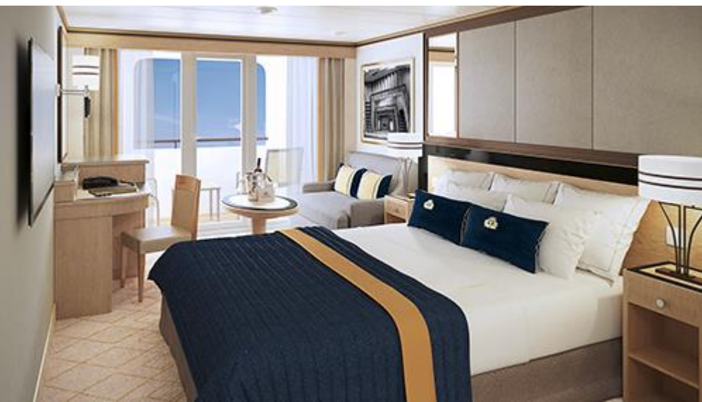
Rendering of Britannia Balcony stateroom

Half of the Britannia Balcony staterooms on Queen Mary 2 will be remastered during the 2016 refit to reveal contemporary new designs inspired by Cunard's rich history. With a carefully phased refurbishment plan into 2017, all Britannia staterooms will eventually feature an elegant new interior design, new carpet patterns that reference designs from the original Queen Mary and bold soft furnishings with imperial blue and antiqued gold highlights to honour Cunard's art deco heritage.