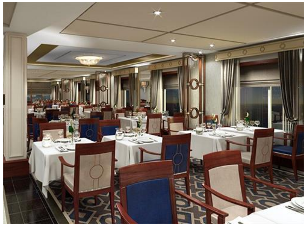
Rendering of Princess Grill restaurant