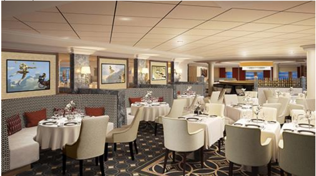
Rendering of The Verandah

Contemporary, premium French cuisine will be offered in the new Verandah which will be a light and elegant space offering impeccable service with attention to every detail. An unforgettable dining experience for a surcharge and a bar will be available for pre- and post-meal drinks.