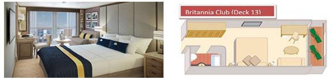
Rendering of Britannia Club stateroom

The refit will see the addition of 30 Britannia Club staterooms to Deck 13, as well as a comprehensive refurbishing of all pre-existing Britannia Club cabins. Queen Mary 2's grand size assures that the added accommodations will not affect the plentiful amount of public space. Refreshed designs will include softer colour tones to enhance the feeling of space, as well as new contemporary carpet patterns inspired by the geometric diamond designs seen on the original Queen Mary. Britannia Club guests enjoy a pillow concierge menu, as well as single-seating dining in the Britannia Club restaurant.