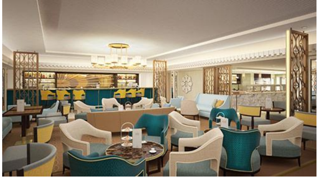
Rendering of the new Carinthia Lounge

Carinthia Lounge will feature a fresh colour palette of powder blue, cream and gold, and versatile seating layouts including dining chairs and tables near the new patisserie and chic curved lounge seating under decorative lights. The spacious venue will also feature a wine wall, vertical metal Art Deco-inspired screens, and a dark walnut timber dance floor.